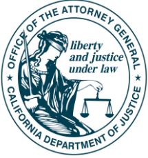
ROB BONTA ATTORNEY GENERAL